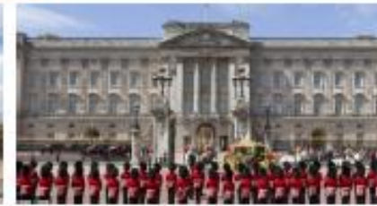
Buckingham Palace (Where the king lives)