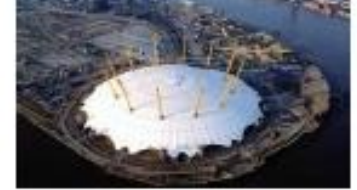
The O2 Arena (Millennium Dome) (Venue for music shows)