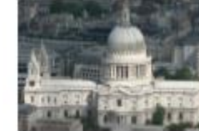
St Paul's Cathedral