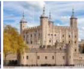
Tower of London (Castle and old prison)