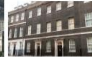
10 Downing Street (The Prime Minister's house)