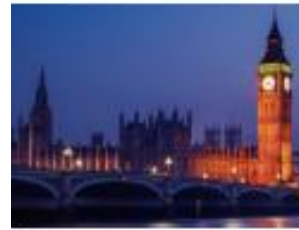
Houses of Parliament (Where laws are made)