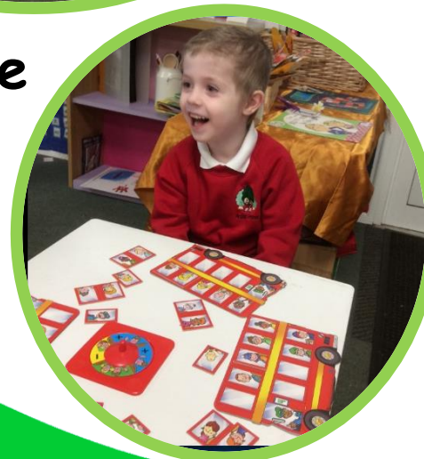
...and excited to learn!