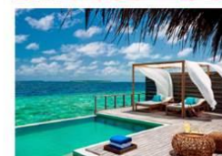
N-Norwich KL-King's Lynn T-Thetford GY-Great Yarmouth S-Sheringham