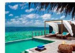
N-Norwich KL-King's Lynn T-Thetford GY-Great Yarmouth S-Sheringham