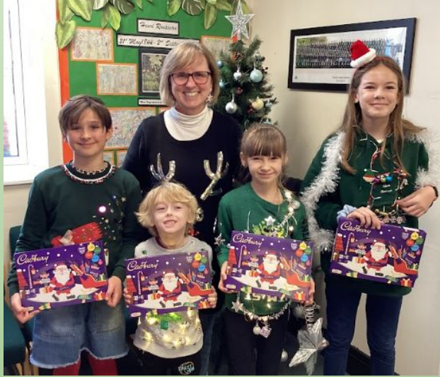
Picture of our winners from 2022

Yes it's a long way off but we want to let you know now that on the last day of term before Christmas we always have a free non-uniform day to celebrate the end of term.