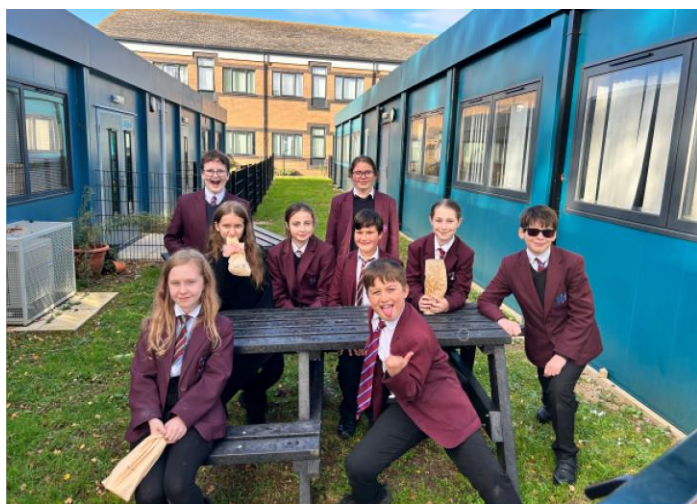
A group of students using one of the new picnic benches