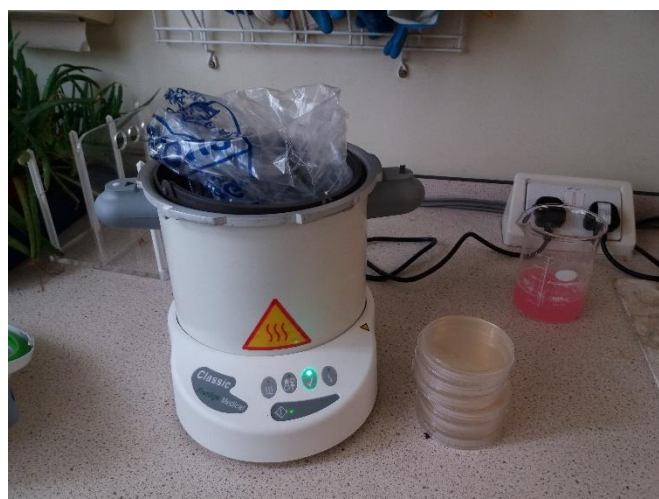
The new Autoclave for the Biology department