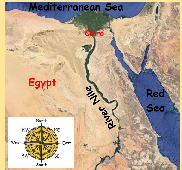
A map of Egypt, showing the capital city and main bodies of water.

The Mediterranean Sea is North of Egypt and the Red Sea is to the East. The longest river in Africa, the River Nile, runs through Egypt to the Mediterranean Sea; it is 6,650km long! The capital city of Egypt is Cairo.