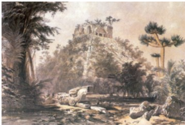
El Castillo at Chichen Itza by Frederick Catherwood (1843)

Numerous archaeological expeditions of the Maya region were launched following the work of Stephens and Catherwood.