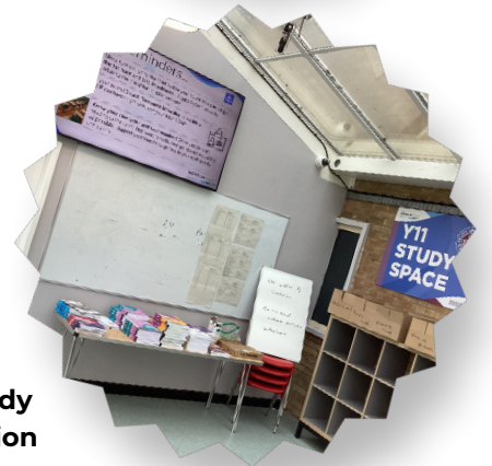
Information screen for the year 11 study area supporting them with organisation & preparing for their GCSEs.