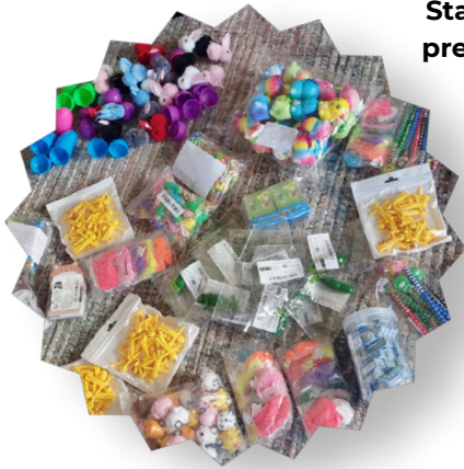
ClassChart Reward Shop items!

Prestige Medical Autoclave allowing sterilisation of equipment for Biology lessons. This has replaced the previous system that required teachers to be present while the items sterilised. The new autoclave has freed up teachers time and allowed equipment to be readily available to students for more frequent experiments. Staff gratefully said 'It has made no end of difference to preparing microbiology practicals safely and efficiently.'