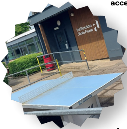
Table tennis tables for recreational time