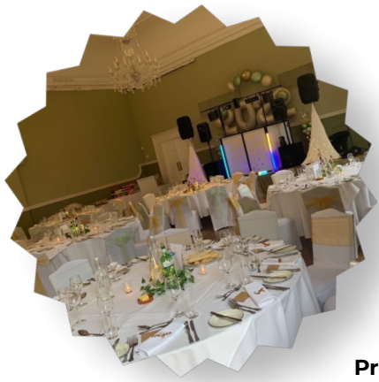
Annual Contribution to Prom!